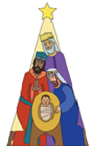
A Light to the Nations

NEXT NEWSLETTER DEADLINE for ANY ITEMS for in the February Newsletter by January 15 th .